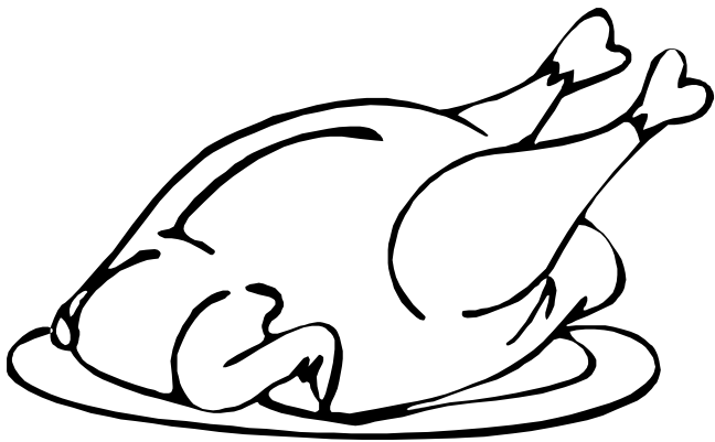
carne de pollo